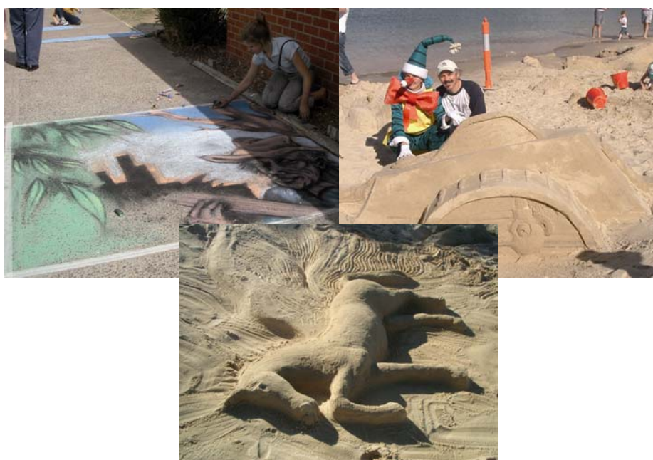
Mosman Festival 2005 Balmoral Fun Day Art Events – CHALK IT UP & Sand Sculpture

Public art can also include a range of performing arts like music, mime, dance, and street theatre presented in the public domain.