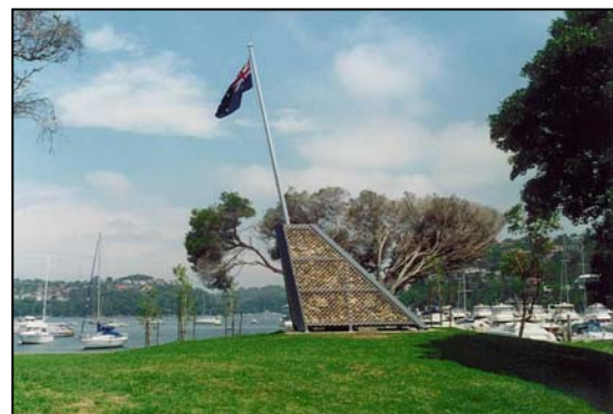
Lucinda Memorial, 2001 by Hadyn Wilson

Public domain refers to sites and settings, which can be publicly or privately owned, and are generally accessible to people such as streets, footpaths, parks, shopping centres, plazas, arcades, beaches, recreation facilities, libraries, community centres, schools, or civic places.