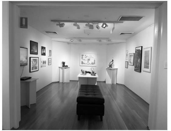
Level 2 Gallery