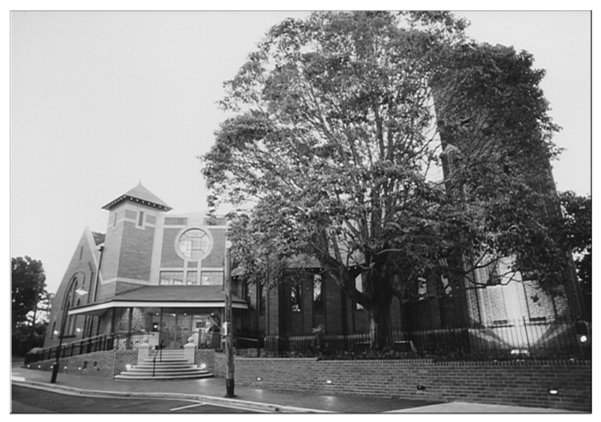
Mosman Art Gallery & Community Centre, 1 Art Gallery Way, Mosman 2088

The centre offers a range of spaces available for hire for various programs and groups, ranging from 5 to 300 people, and is wheelchair accessible. It is the perfect venue for cultural events, wedding ceremonies or receptions, special occasions, cocktail functions, concerts and performances, corporate programs, business and community meetings, expos, health and lifestyle events, conferences and seminars. The centre is fully equipped with a full range of furniture, a commercial kitchen, glassware, crockery, cutlery and napery, audio-visual equipment, a grand piano and many other facilities.