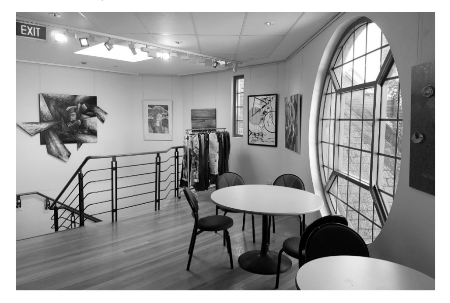
Level 2 Annexe