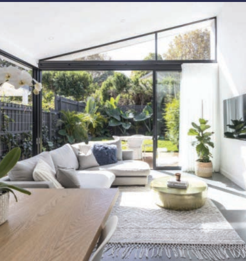
Mosman Semi-Detached Dwelling

hecticrAt Architects (Demis Roussos Bhargava)