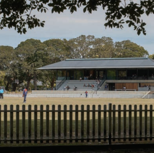
Allan Border Oval Pavillion